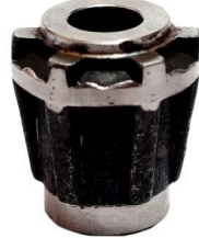
Boss center YAMAHA