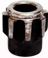
Boss center MAHINDRA