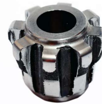
Boss center SUZUKI