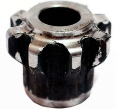
Boss center SUZUKI