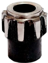
Boss center HONDA