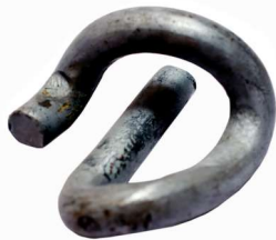
Elastic rail clip