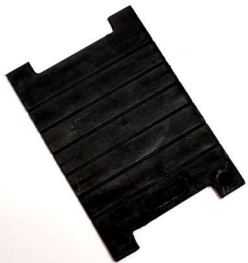
Grooved rubber pad