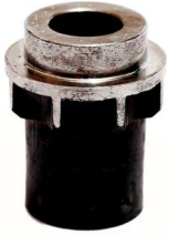
Boss center TVS