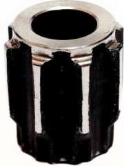
Boss center HONDA